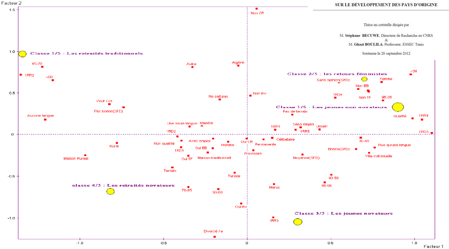
Figure IV. 1: Les 5 classes des migrants de retour sur le plan des deux premiers axes

Return of non-innovative young migrants (Class 1) Return of women migrants (Class 2)